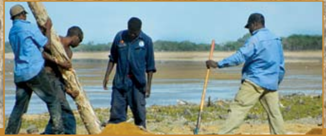
Beach Rehabilitation at Running Creek.