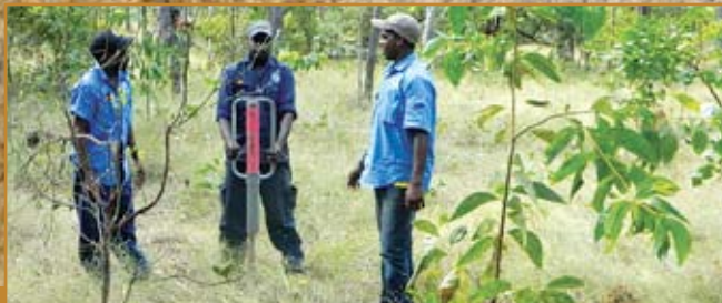
Setting up a monitoring Point.