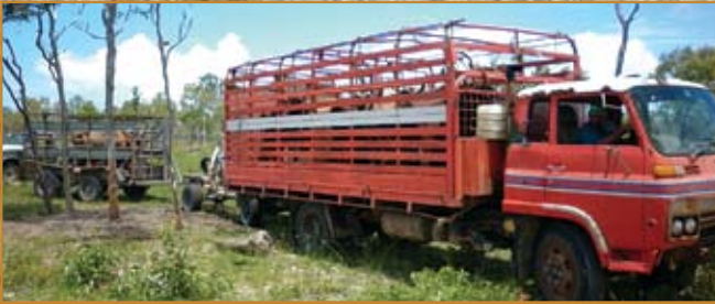
Mustering at Silver Plains.