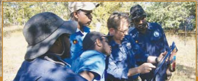
GBRMPA Landbased Patrol.